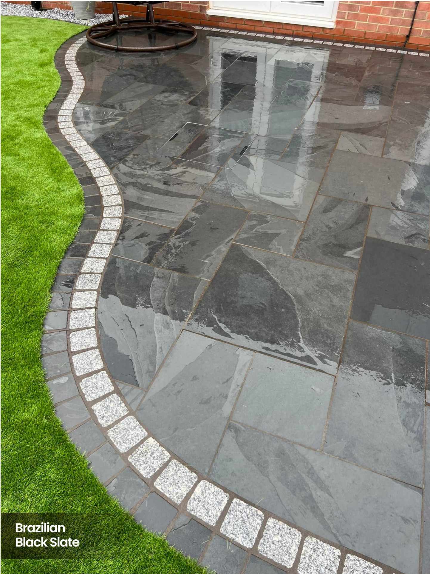
Brazilian Black Slate